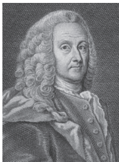
C.F. Clemens: L. Holberg, Statens Museum for Kunst, public domain

This design is part of a little collection inspired by the works of the famous Danish-Norwegian poet and author Ludvig Holberg . Holberg lived from 1684-1754, and even though this is a long time ago, he had a very special talent for showing – and exposing – different types of people, which is a big part of what makes him relevant still today.