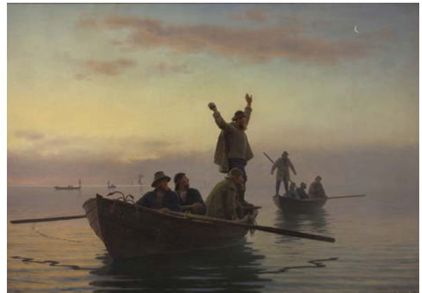
A. Dorph, Hornfiskefangst med drivvod. Tidlig morgen, 1880 Statens Museum for Kunst Public domain

18 (19) 20 (21) cm. Bind off the centre 29 (33) 37 (41) sts and finish each side separately. Bind off 2 sts at the neck edge at the beginning of the row a total of 2 times, then 1 stitch 1 time. Work straight across the remaining 45 (49) 53 (57) sts until the armholes measure 20 (21) 22 (23) cm. Slip the sts for the first shoulder to a stitch holder and finish the second shoulder in the same way as the first, only mirror reversed.