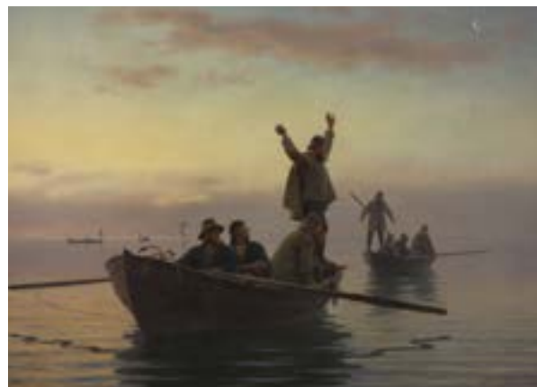
A. Dorph, Hornfiskefangst med drivvod, 1880 Statens Museum for Kunst Public Domain

as above every 4th round a total of 24 (25) 26 (27) times. There are now 100 (106) 112 (118) sts on the needle. Work straight in pattern until the sleeve measures approx. 46 cm or the desired length. End on the same row of the pattern as on the body.