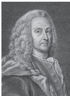
C.F. Clemens: L. Holberg

This design is part of a little collection inspired by the works of the famous Danish-Norwegian poet and author Ludvig Holberg . Holberg lived from 1684-1754, and even though this is a long time ago, he had a very special talent for showing – and exposing – different types of people, which is a big part of what makes him relevant still today.