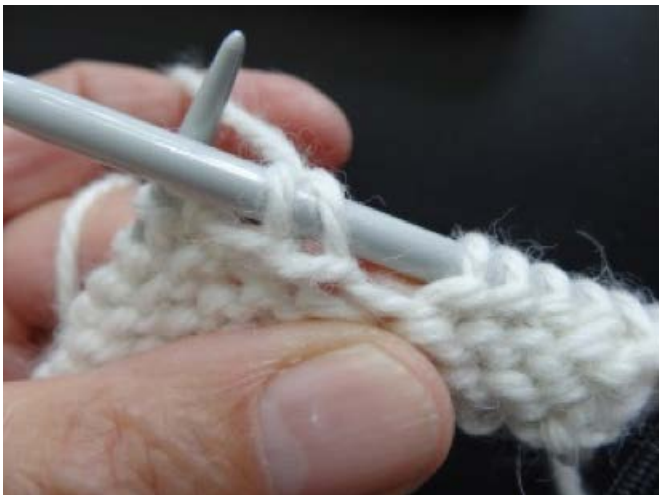
Photo 2. Pull the yarn up and over the needle to make the stitch appear like a double stitch.