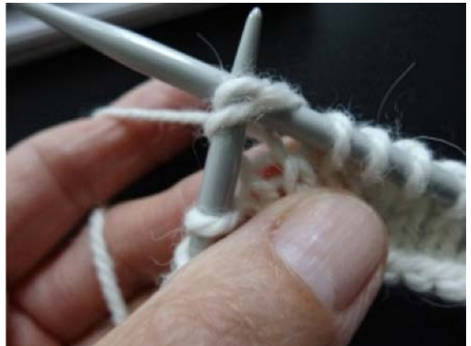
Photo 4. The two loops are worked as one stitch.