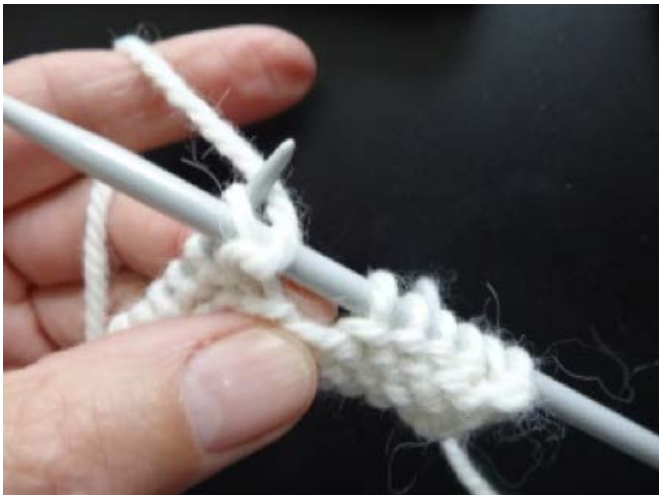
Photo 1. Slip the first stitch purl-wise with the yarn held towards you.