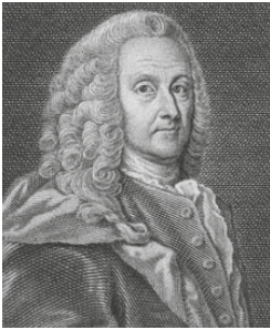
C.F. Clemens: L. Holberg

This design is part of a little collection inspired by the works of the famous Danish-Norwegian poet and author Ludvig Holberg . Holberg lived from 1684-1754, and even though this is a long time ago, he had a very special talent for showing – and exposing – different types of people, which is a big part of what makes him relevant still today.